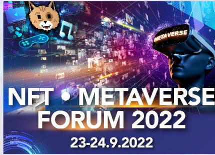
NFT • Metaverse Forum 30 mins (分鐘)