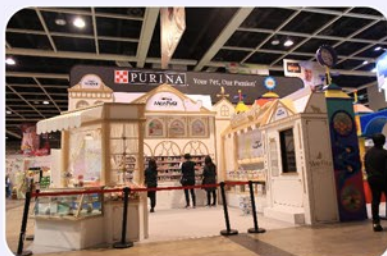
4 Booths (展位)