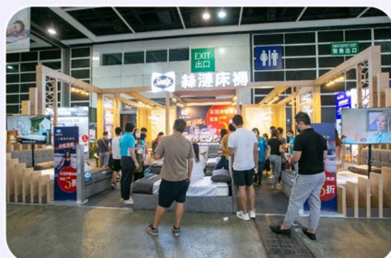
9 Booths (展位)