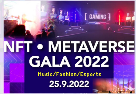
NFT • Metaverse Gala 60 mins (分鐘)