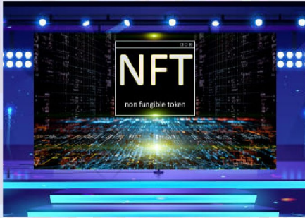
Main Stage 主舞台 30 mins (分鐘)