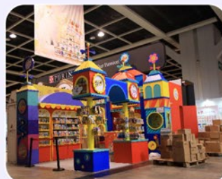
2 Booths (展位)