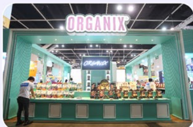
6 Booths (展位)