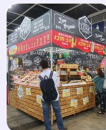
1 Booths (展位)